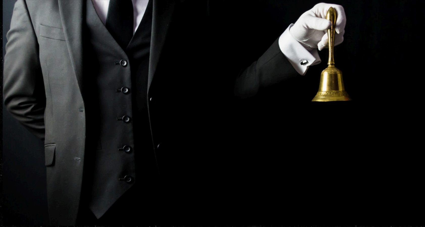
24/7 Luxury Concierge