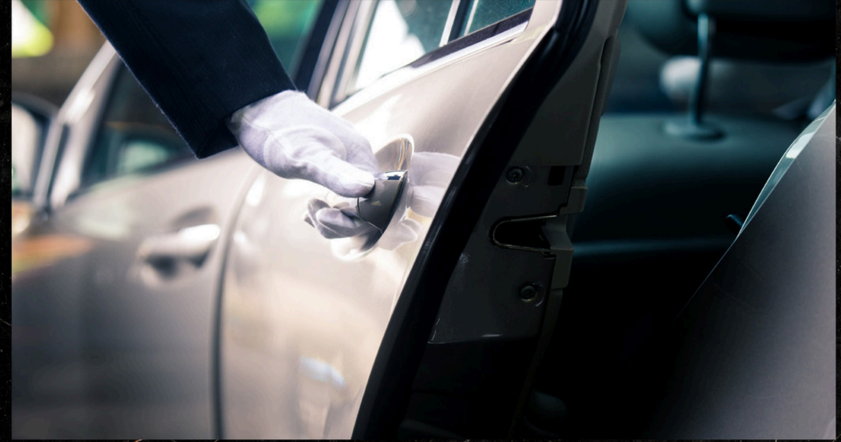
Dedicated Chauffeur Service