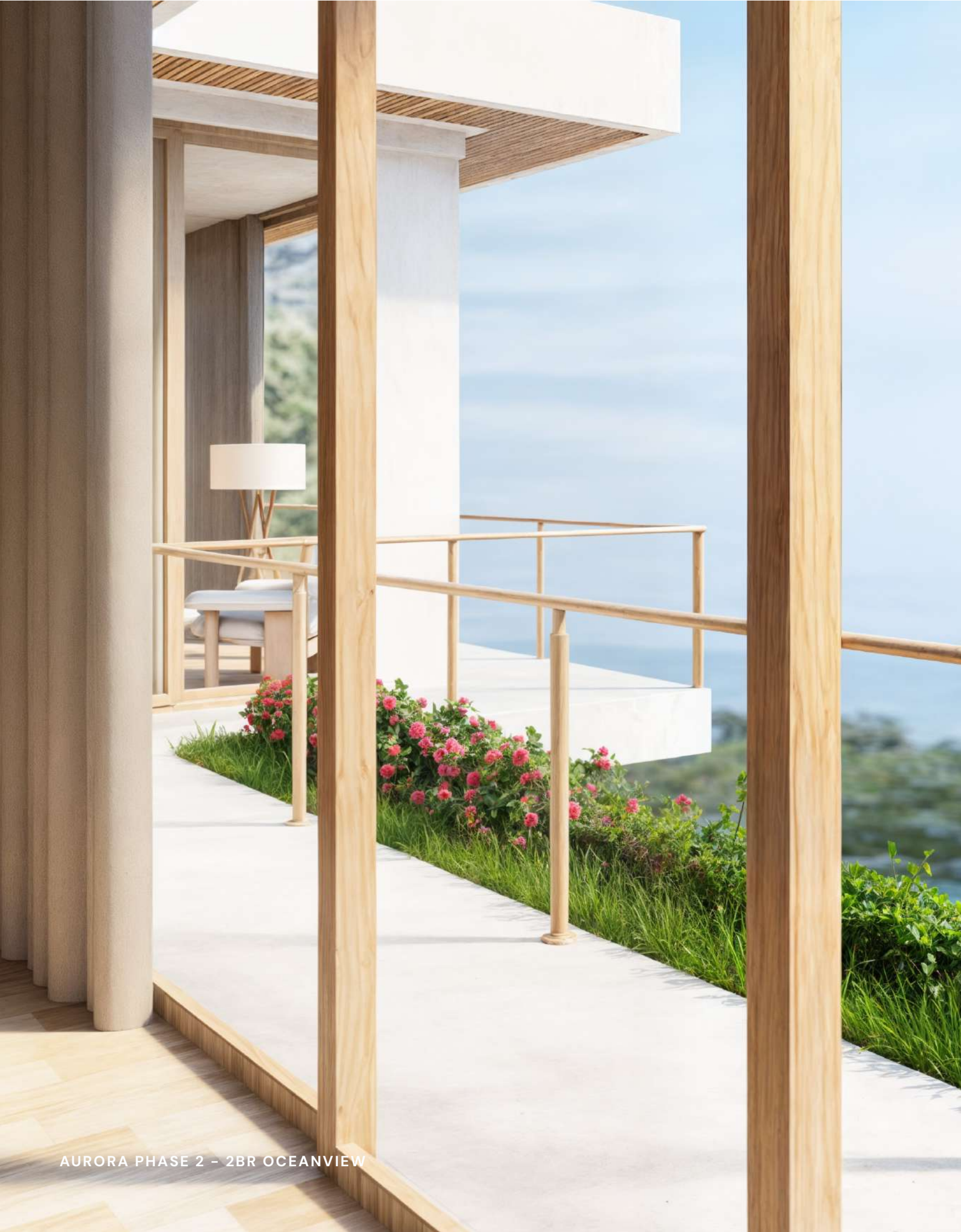
AURORA PHASE 2 - 2BR OCEANVIEW