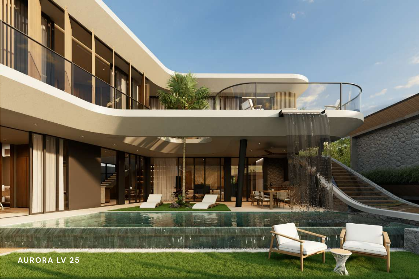
AURORA LV 25