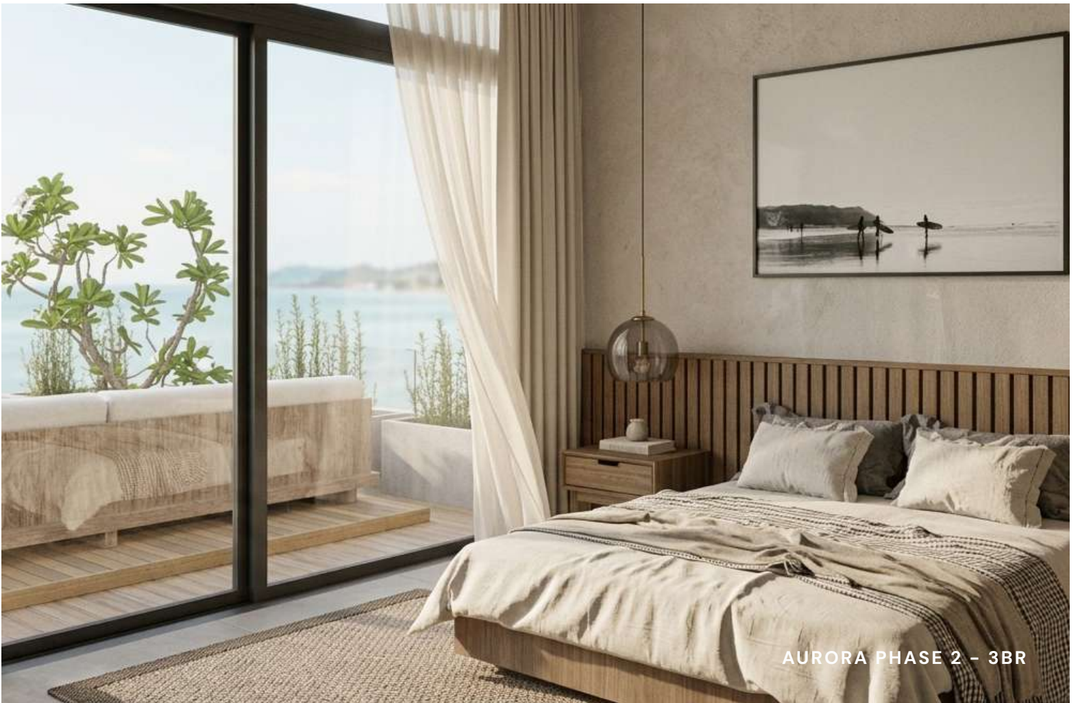
AURORA PHASE 2 - 3BR