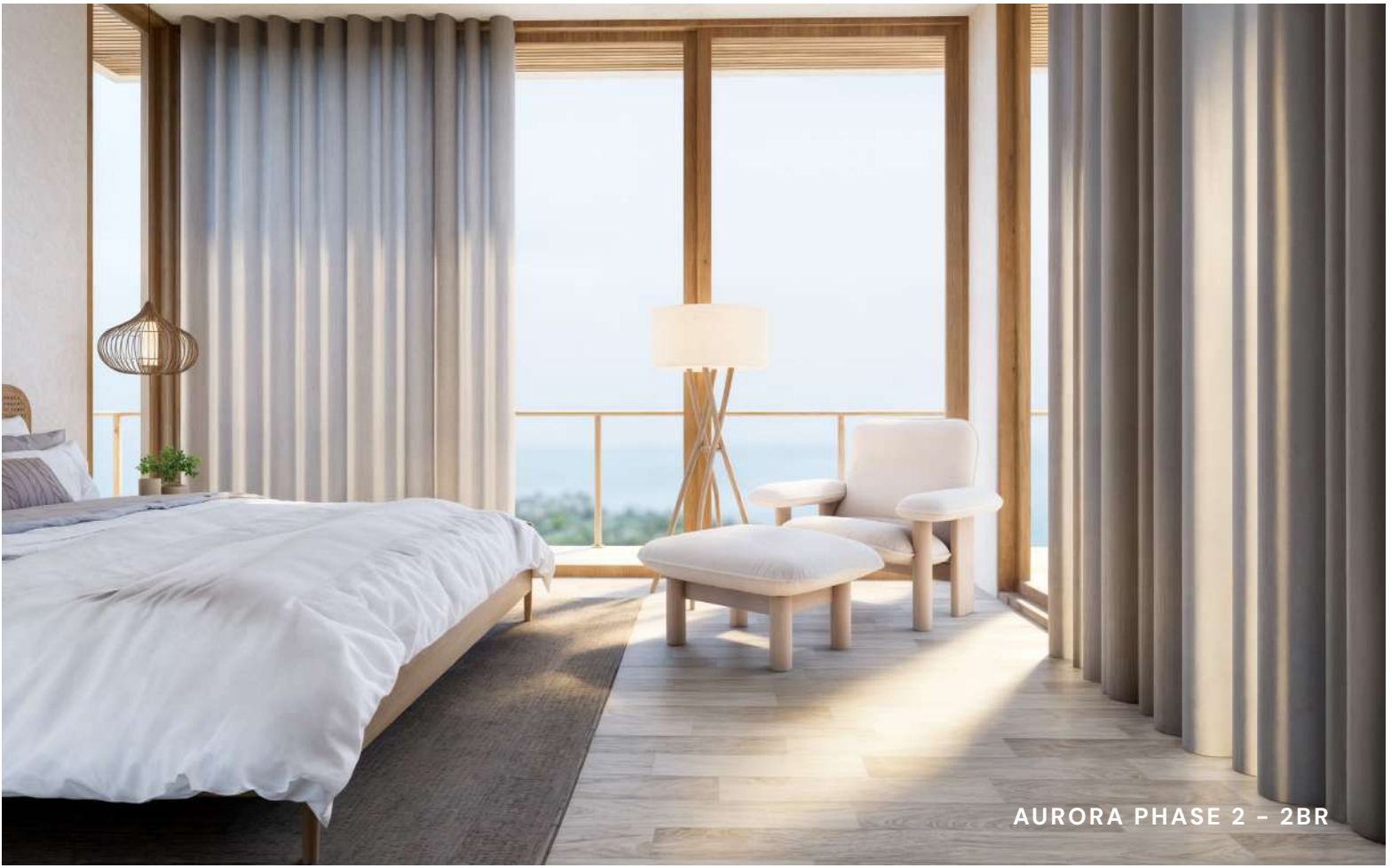
AURORA PHASE 2 - 2BR