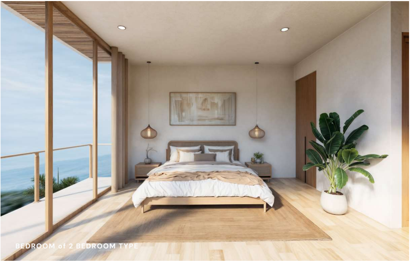
BEDROOM of 2 BEDROOM TYPE