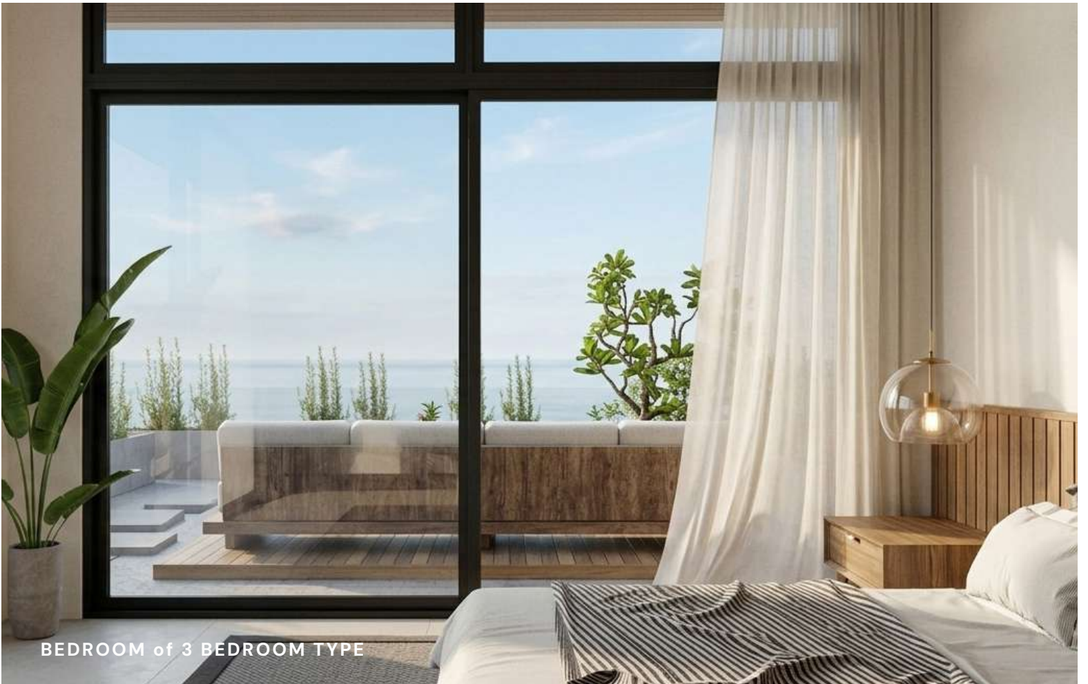
BEDROOM of 3 BEDROOM TYPE